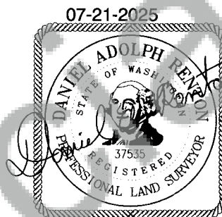
EXHIBIT “ ”