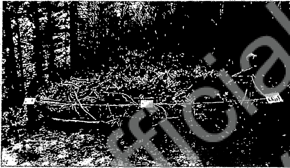
Pressure-treated 4x4's up to 24" high with rope.