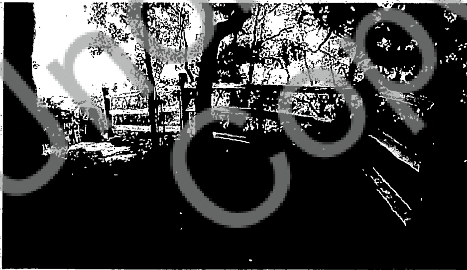
Split-rail natural cedar fencing up to 4' high.