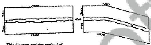
This diagram explains method of description of claim.

State of Washington County of Skamania (or Recording Precinct) Skamania Mining District Lead Claim "Primary Gold No 4"