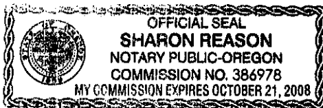
Notary Public in and for the State of Oregon