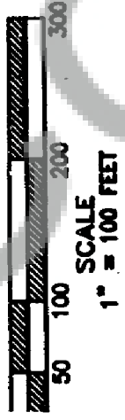
EXHIBIT "A" PG 1 OF 2