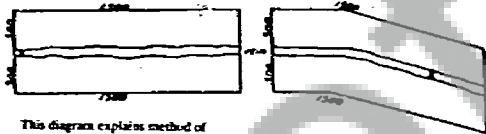
This diagram explains method of description of claim.

State of Washington County of Skamania (or Recording Precinct) At Adams Mining District _____