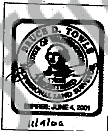
EXHIBIT A PAGE 3 OF 3