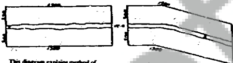
This diagram explains method of description of claim.

State of WASH County of SKAMANIA (or Recording Precinct) Mining District MCCOY CREEK