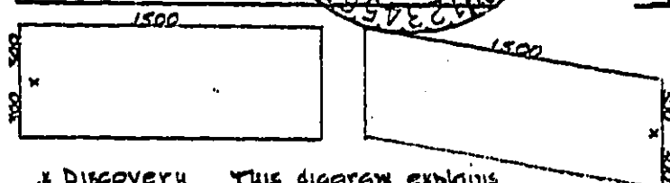
X Discovery This diagram explains the mode of staking

for Utah International, Inc. 550 California St. San Francisco, Ca. 94104