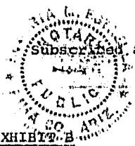
Exhibit B - Property affected by Community Property Agreement

Subscribed and sworn to before me this 12 th day of April , 1976.