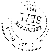
EXHIBIT "B" "A"